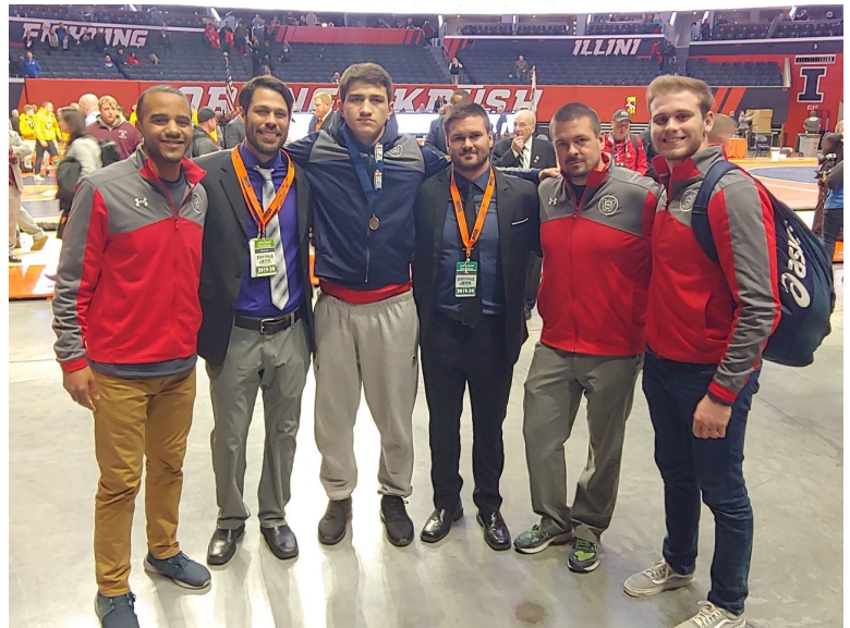
IHSA High School Wrestling Tournament