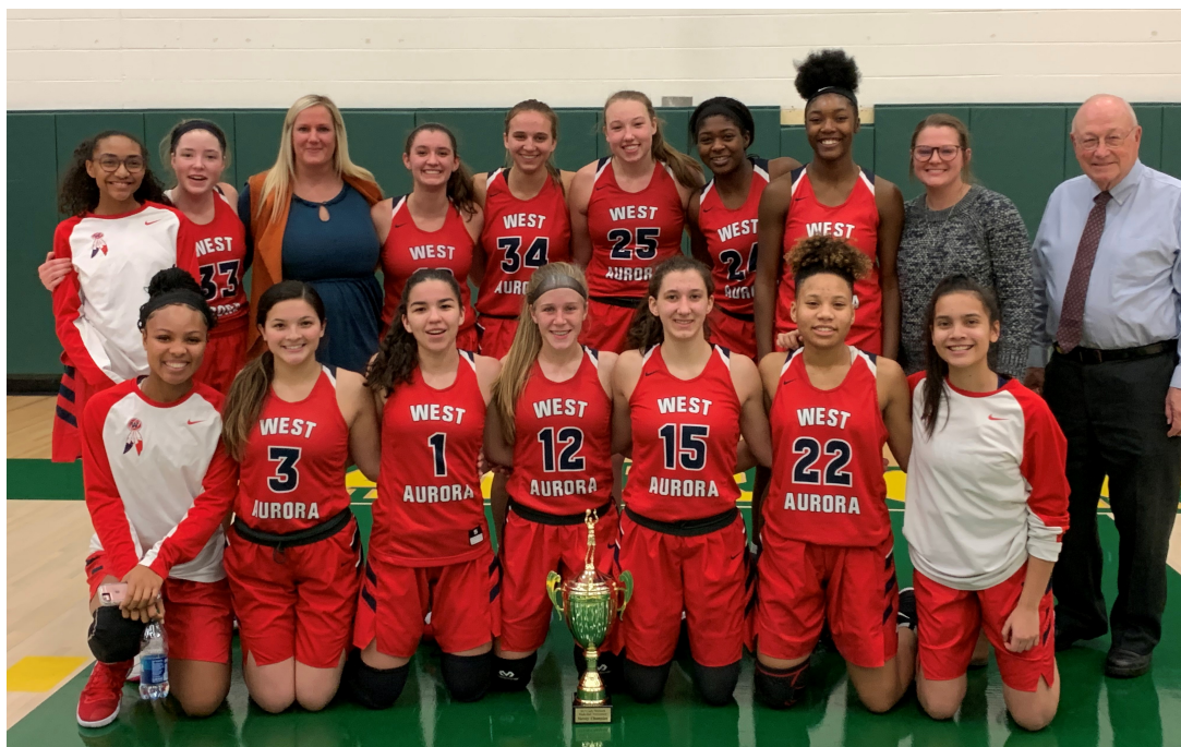
2019 WARHAWK TOURNAMENT CHAMPIONS