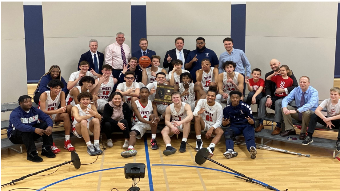
2020 Regional Champions

Boosters: http://www.blackhawksportsboosters.org/ Athletics: http://il.8to18.com/WestAurora/