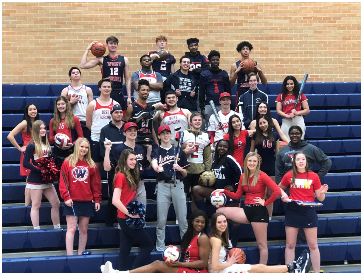
The 2019-2020 West Aurora Blackhawk 3-Sport Athletes